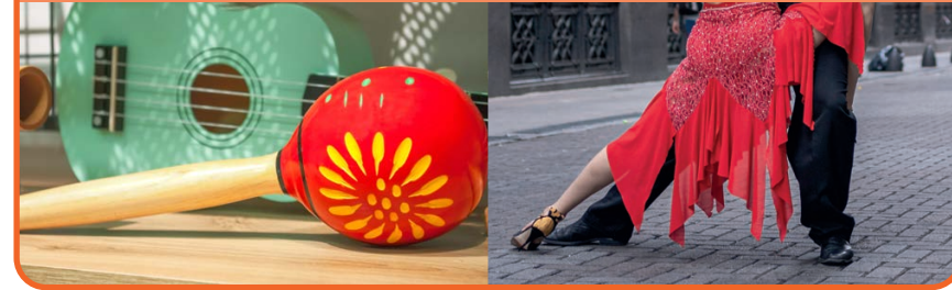
A salsa rhythm

Music and dance are very important to Latin American culture.